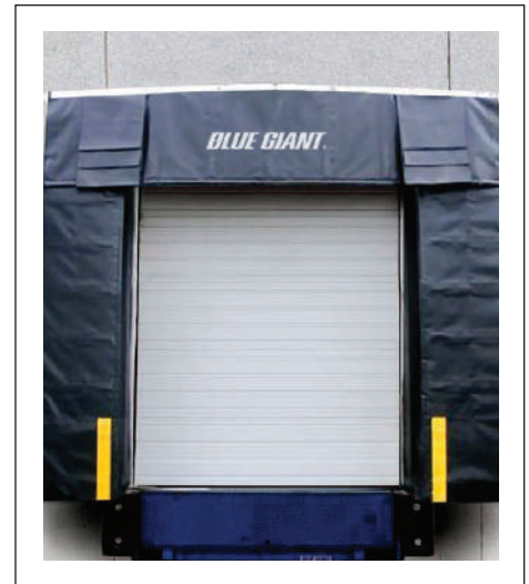
BGDSHF Foam Dock Shelter